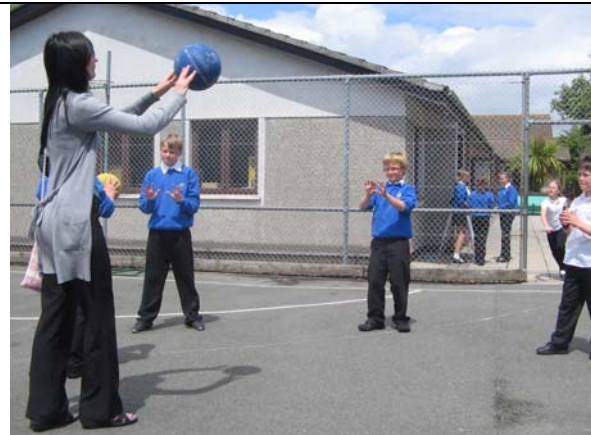
TA's actively encouraging positive physical activity in their zones.