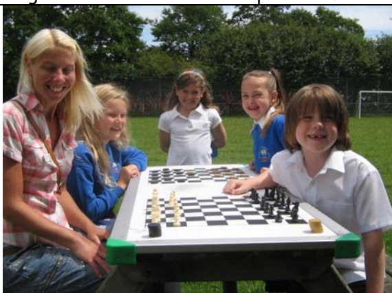
Children using new 'Activity Boards' with TA support.