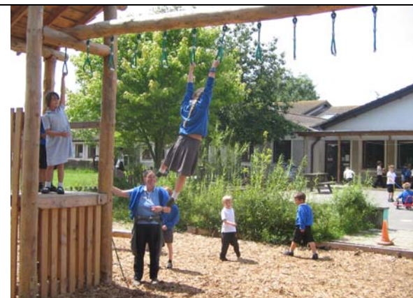
Infants and juniors sharing use of new play area.