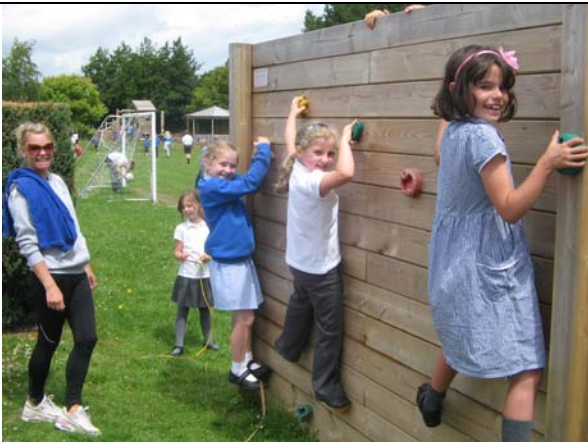
Children using Traverse wall with TA supervision/encouragement.

Children are also encouraged to reward positive play by giving stickers to other children (from their class or another) if they have helped/supported each other through their playtime.